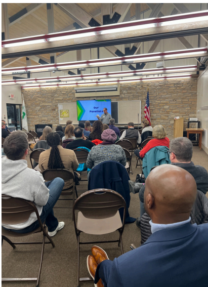
“Save the Farm, Save the Future” Screening

Bethesda Green launched a sneaker recycling drive with Got Sneakers, collecting hundreds of pairs of gently used shoes that would otherwise go to landfill—demonstrating strong community commitment to reuse and responsible consumption.