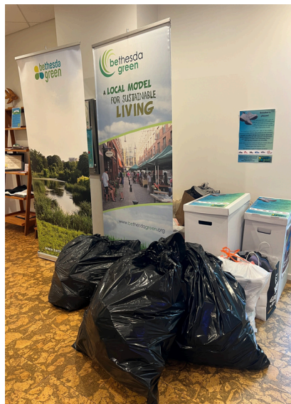
Got Sneakers Recycling Drive