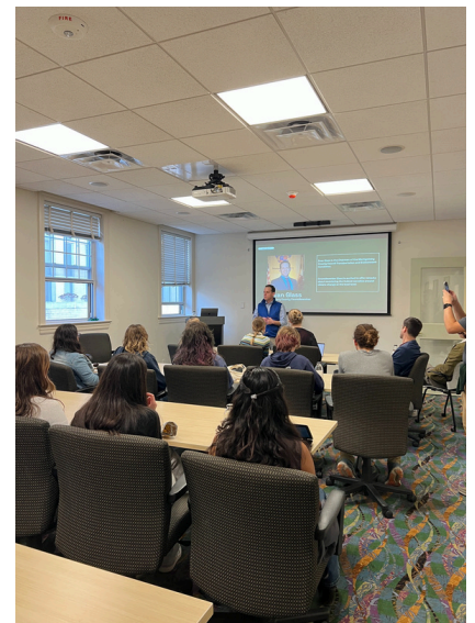
Youth Climate Summit 2025